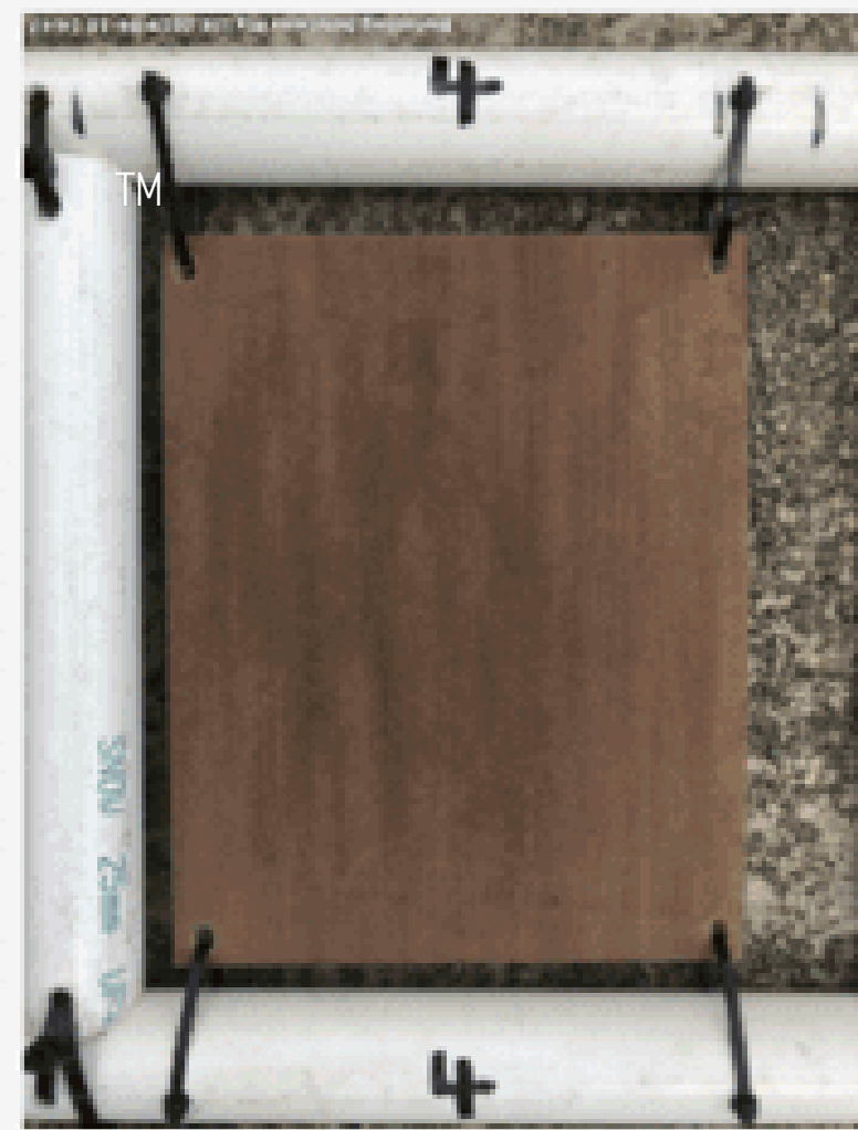
Time Zero With treatment