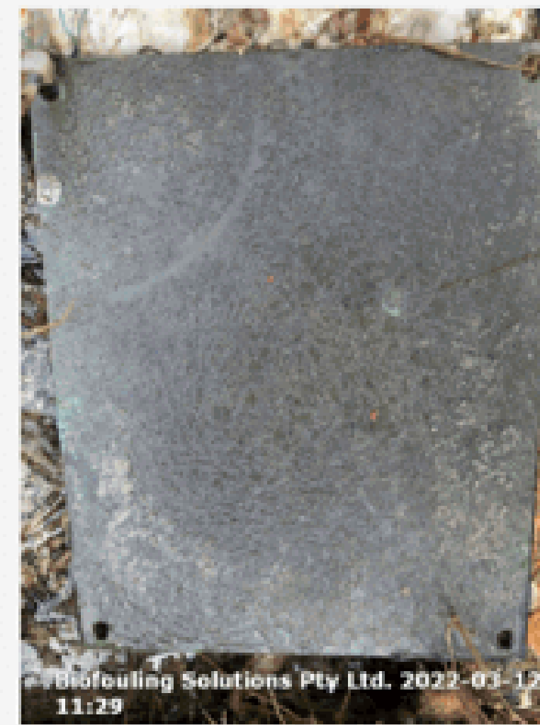
35 months later With treatment